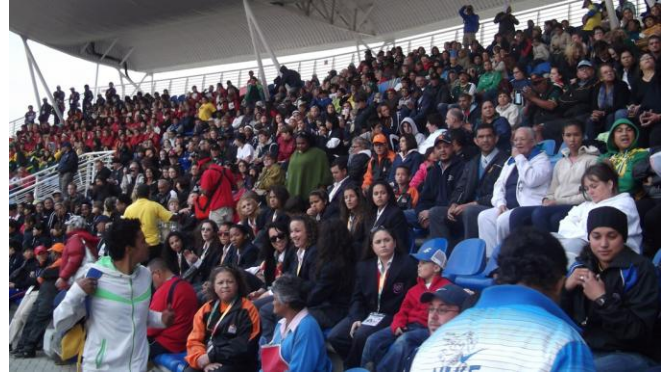
A capacity crowd at the junior women's world championship in South Africa.

World Championship page on Facebook. In addition, the tournament mascot is tweeting at twitter.com/sonke2011. The 15 participating countries are rounded out by Argentina, Australia, Brazil, Canada, China, Chinese Taipei, Czech Republic, Germany, Japan, New Zealand, Puerto Rico, Russia, and USA.