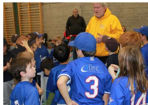
BeeBall Clinic in Basel - Switzerland

According to the teachers, BeeBall will now become a regular part of their school program