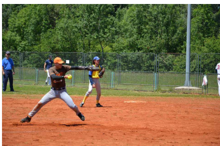
Pitcher in action