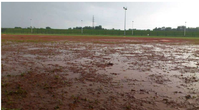
Summer shower