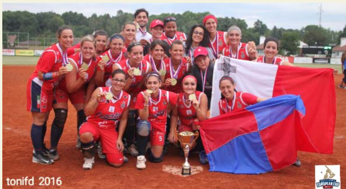
European Cup B winner: Mediterraneo (MLT)

the right to send a team to the next year's Premiere Cup.