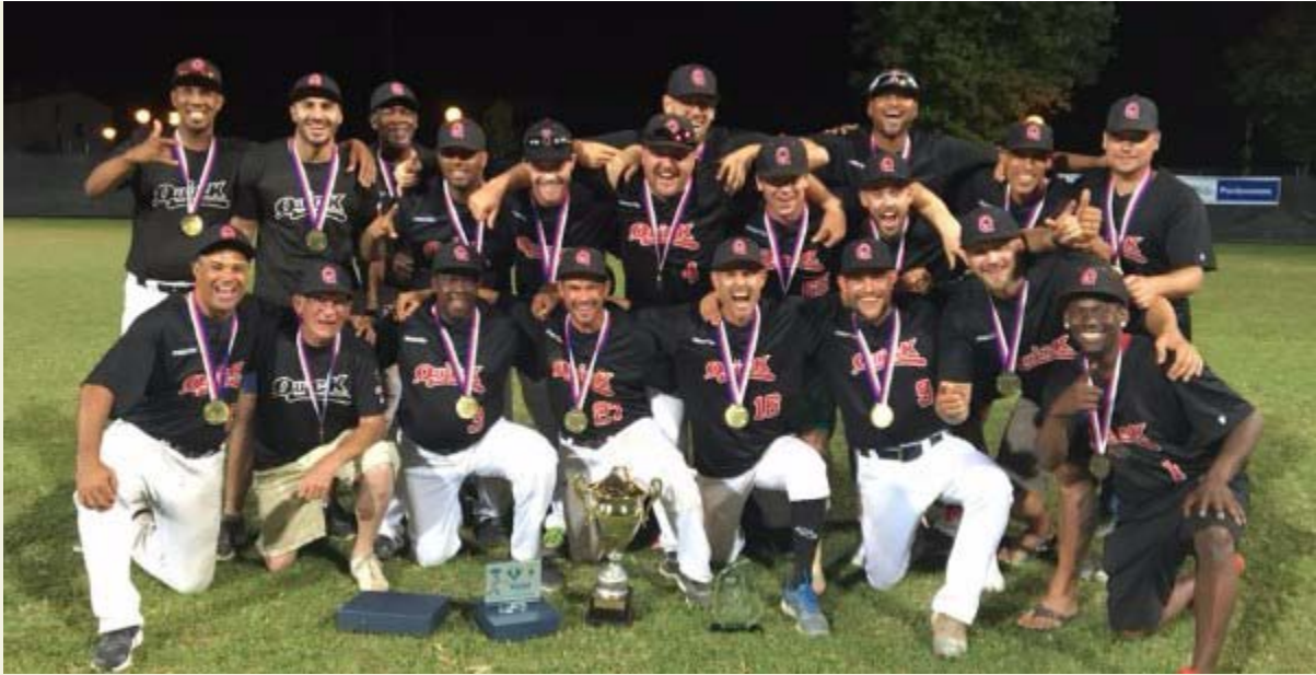
ESF Cup winners: BSC Quick Amersfoort (NED)