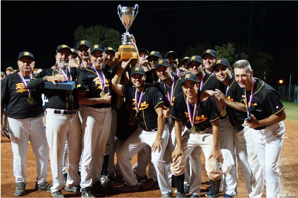
European Super Cup winner: Pro Roma (ITA)

Men's Super Cup is the largest men's fastpitch softball competition in Europe and it is held every year. This is also the highest-level men's softball tournament in Europe thanks to the possibility of including pick-up players from outside Europe - typically Argentina, New Zealand, Australia - in the rosters.