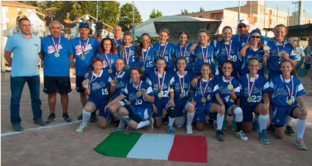
European Massimo Romeo Youth Trophy winner: Italy 1 (ITA)

This annual European tournament for players under 13 years of age reached a new era by allowing boys to compete together with girls. Eight teams from six countries came to Italy to engage in so called "Festival of Youth". Two Italian selections played the final game and Italy 1 ended up as the winner of the trophy.