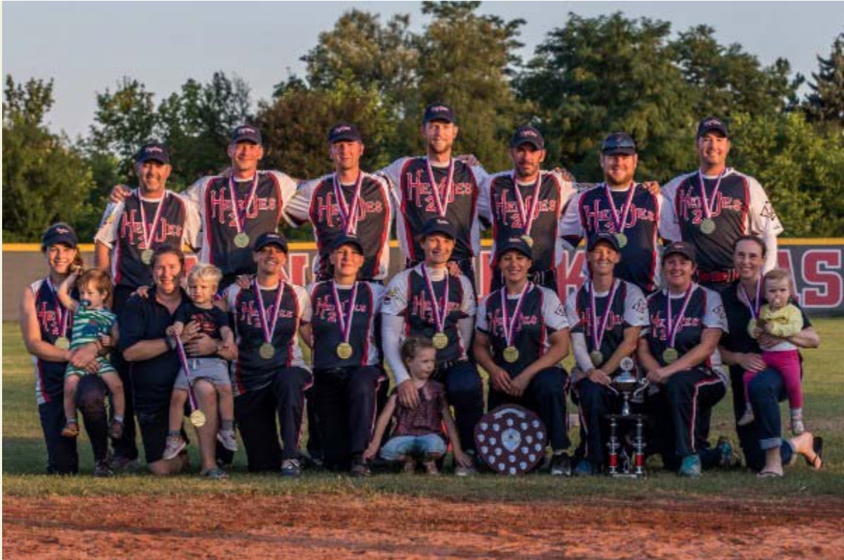
European Super Cup Coed Slowpitch winner: H2O (GBR)

A record number of 14 teams took part in the Slowpitch Super Cup. Unlike the European Slowpitch Championship, the Super Cup has had winners from other countries than just Great Britain, however this year, two British teams dominated this tournament and met in the final game. In the end, H2O won the 2016 Slowpitch Super Cup.