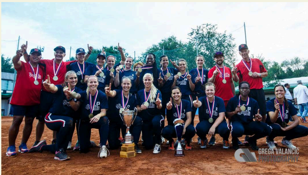
European Premiere Cup winner: Sparks Haarlem (NED)

Nine teams took part in this tournament, while another eight teams played simultaneously European Cup B, whose winner advances to the Premiere Cup for the next season.